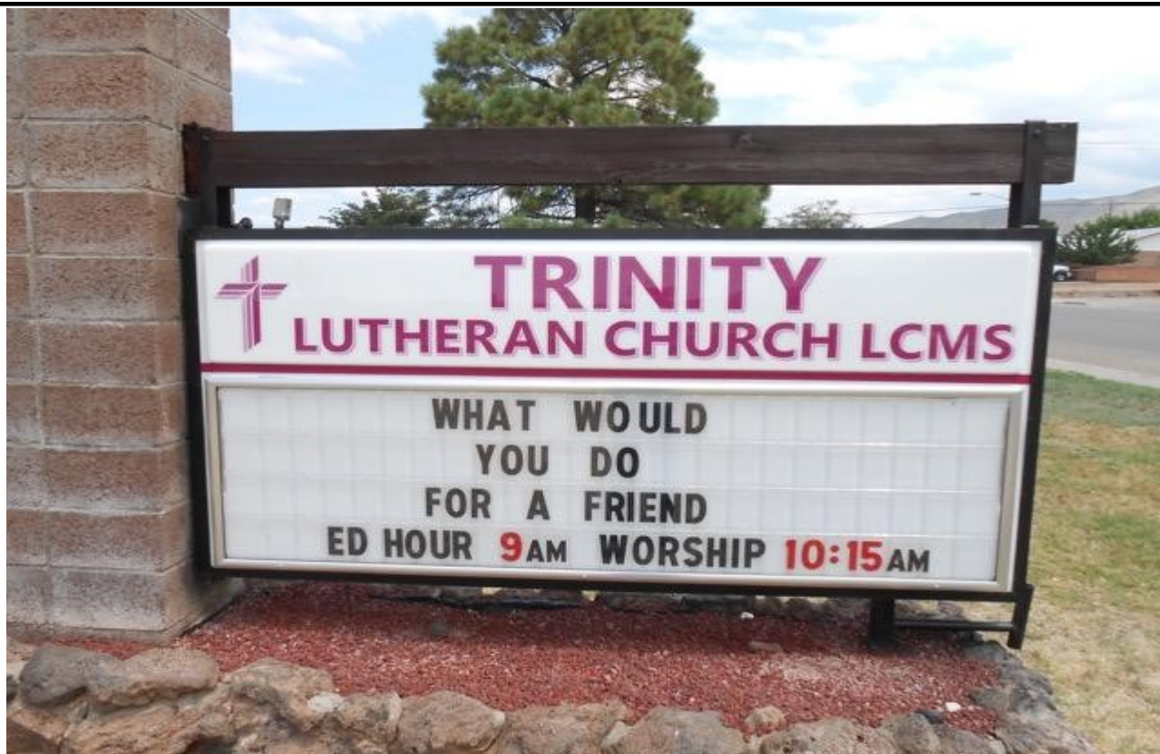
TRINITY'S NEW SIGN